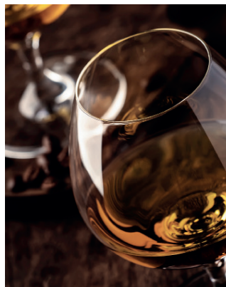
Armagnac is produced in the region

lanes and the numerous, old stone properties set on the top of hills, the Gers has become known as the Tuscany of France for good reason. In addition, it embodies the quintessential French rural lifestyle combining a perfect blend of natural beauty, cultural heritage and gastronomic delights with pretty architecture and small friendly villages.