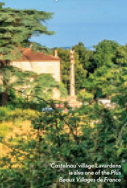
‘Castelnau’ village Lavardens is also one of the Plus Beaux Villages de France

“Nestled in the heart of the southwest, the Gers is the stuff of picture postcards”