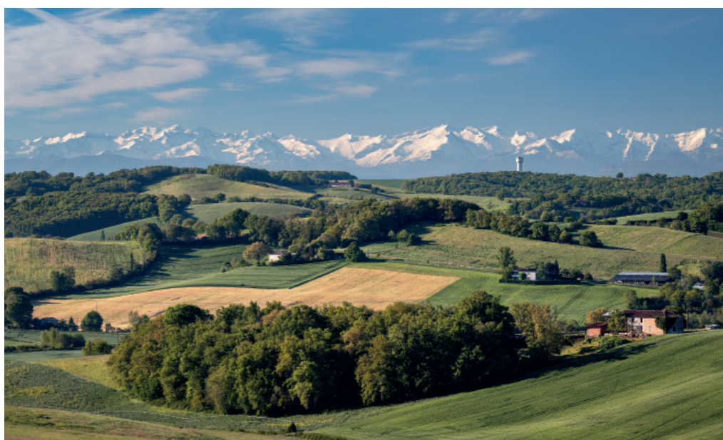
A picture-postcard landscape of rolling hills with vineyards, rivers and hilltop villages, and the Pyrénées as a backdrop

Discover the charms of the Gers department – part of the old Gascony region – and discover why it is one of the best places to buy a house in France, writes Nadia Jordan