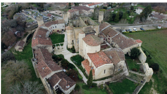
Larressingle is a medieval fortified village in the northern Gers

cafés within easy walking distance. Many also have small gardens, a terrace or a balcony, perfect for that morning coffee or evening aperitif.