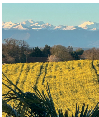
Sunflowers in the Pyrénées foothills

Thanks to the rolling hills, gentle landscapes, tree-lined