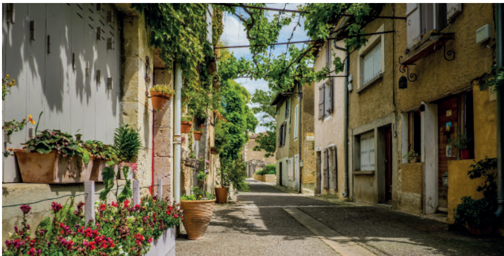
A town of art and history, Lectoure is on the Chemin de St-Jacques-de-Compostelle